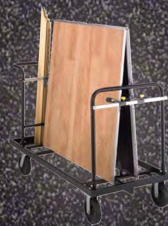
Each caddy holds 24 panels and all matching trim.